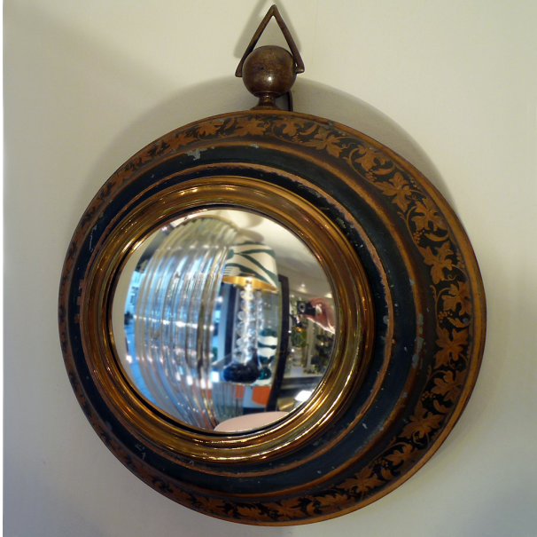
ANTIQUE CONVEX MIRROR FRANCE, 19TH C.

convex french director mirror france, 19th c., painted metal